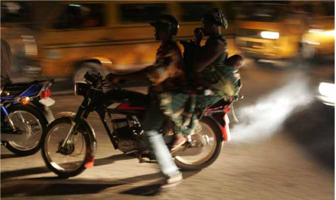
Motorbikes and minibuses as transport options in Lagos, Nigeria.

The choice of the mode of transport for any trip is rarely an entirely free choice and often determined by financial resources available to the individual. At the same time, travel choices are shaped by the mobility needs of communities, the quantity and quality of mobility options or complementary alternatives, land use factors as expressed by the location of employment opportunities or services and housing affordability.