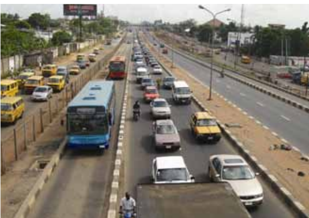
Lagos, Nigeria – BRT Lite.

Further benefits to the community included the introduction of area-wide ticketing, routes and passenger information. Compensation could be paid to operators and training in financial management has been organized. By reducing the number of operators, integrated transport planning and integration between the different operators was made easier and more efficient. Bilateral aid has been forthcoming and this would not be an option without the creation of these formally-recognized bodies.