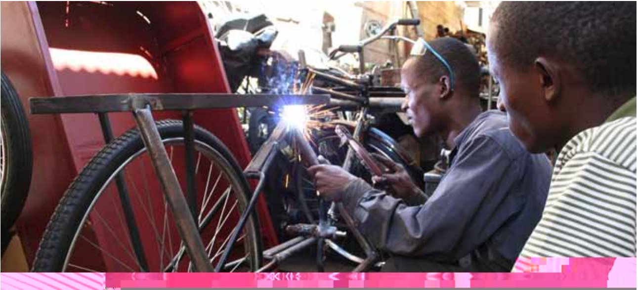
Work in the bicycle workshop.