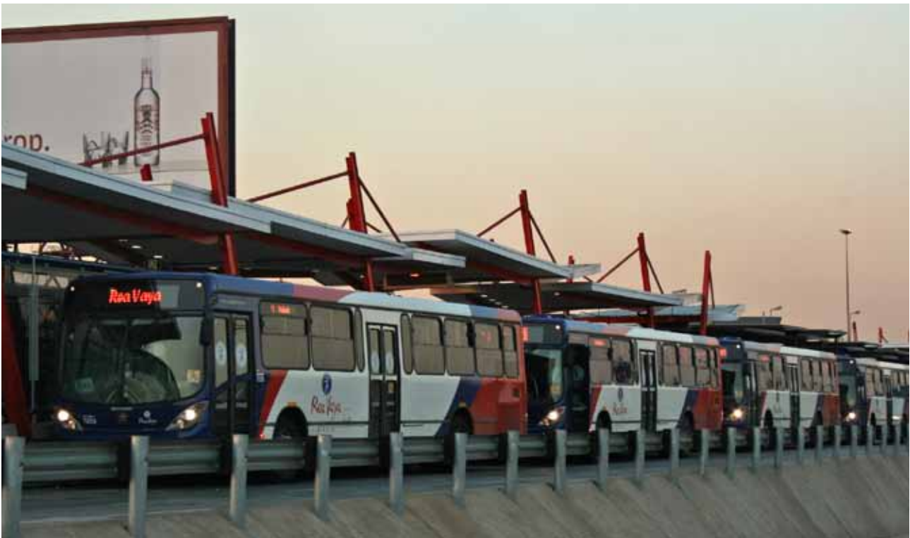
Rea Vaya Fleet in Johannesburg, South Africa.