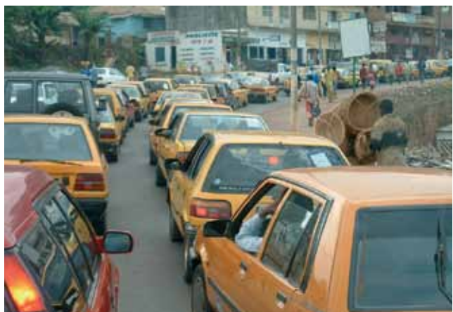
Traffic congestion in Yaounde, Cameroon.

In 1999, public transport in Dakar was dominated by the informal sector, which made it extremely fragmented and difficult to manage. It was estimated that deficits associated with the transport system cost about 4 per cent of GDP. There were more than 1,200 minibus operators and converted vans nicknamed 'car rapides' and 'ndiaga nidaye'. The majority of operators owned between one and four vehicles, a typical pattern in most African cities. In Dakar, the vehicles were on average 28 years old and operators were not in a sufficiently stable