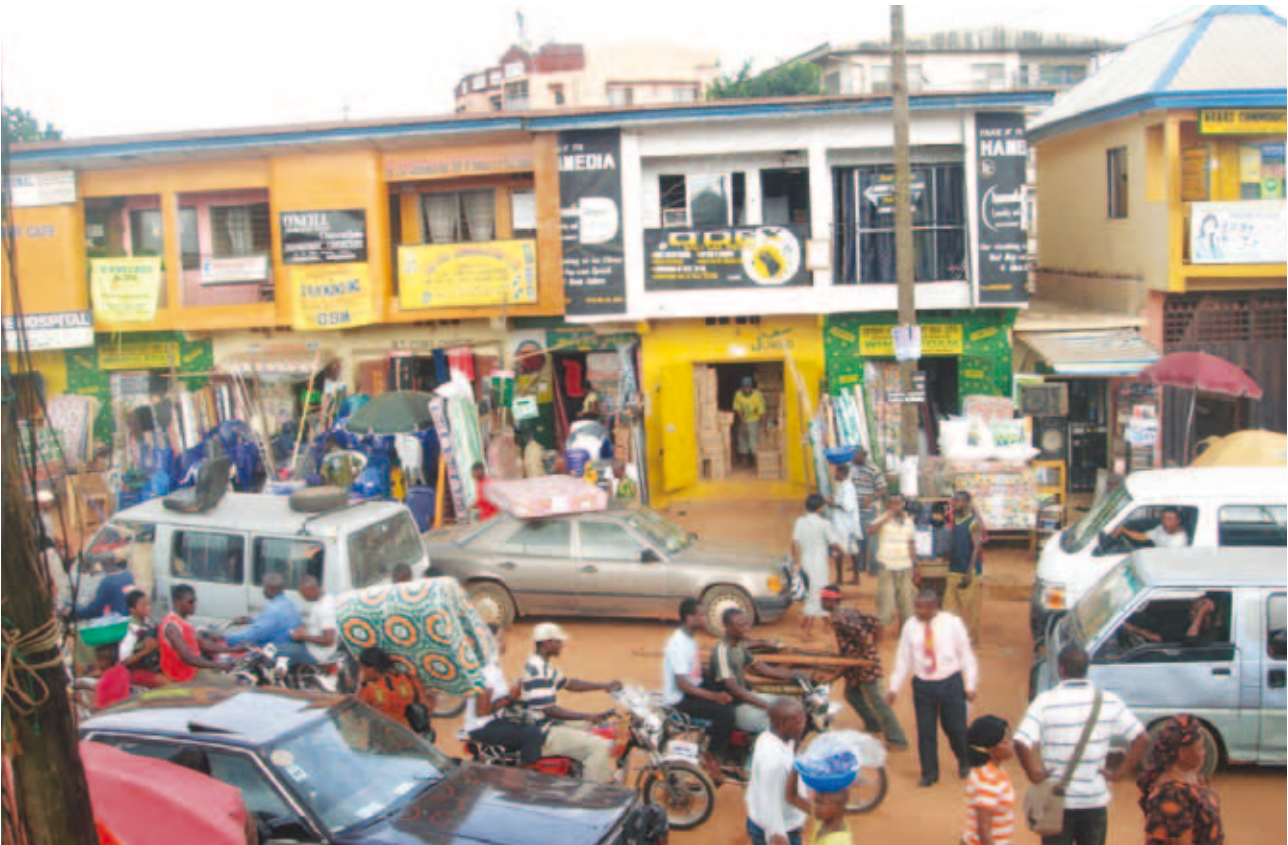
Different modes of transport sharing the road in Lagos, Nigeria.