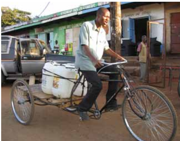
Load-carrying bicycle in Nairobi, Kenya.

UN-HABITAT has been working in three informal settlements (Kibera, Mirera-Karagita and Kamere) to demonstrate the viability of non-motorized transport as an alternative, efficient and sustainable tool for water and sanitation service provision and for generating new income-earning and business opportunities amongst low-income communities. A utility bicycle workshop has been set up for the design, production, and sale of NMT load-carrying vehicles. Self-sustaining solid waste management and water vending businesses and enterprises have been developed, and transport has become more accessible for the residents.