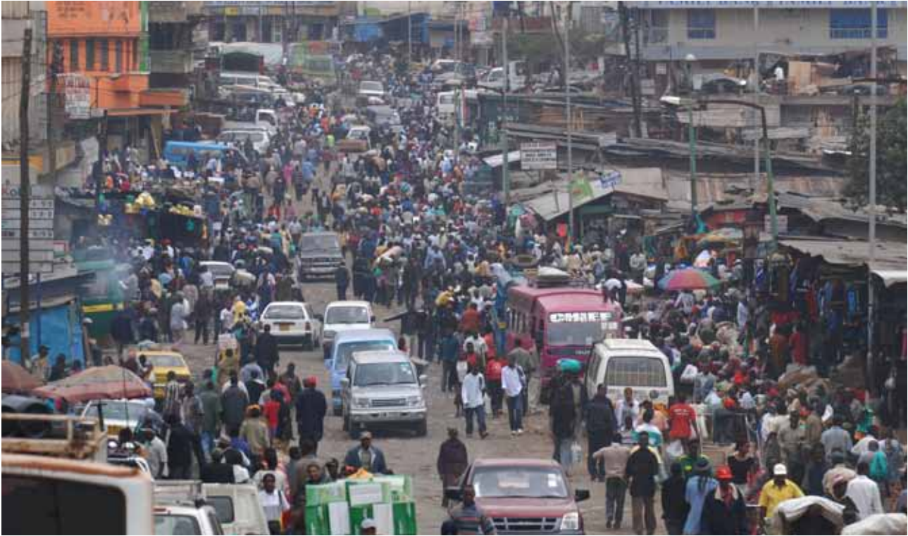
A busy street in Gikomba market, Nairobi, Kenya.

The situation of and the impacts caused by the transport sector in Africa matches the picture described for developing countries in general. Fast-growing cities demand increased transport services and they are especially prevalent in Africa.